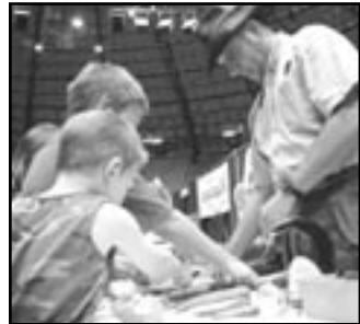
Dino World offers close up experiences with fossils.

This year, four themed towns beckon guests of all ages to come and explore the many wonders of water. The Learning Lab features over sixty different booths inside Freeman Coliseum. In our H2O Hero Village , you will enjoy a number of educational games and attractions including Bucket's Bungee Pull , H2O Quest , and Fishing for Pollution . Cowboys and storytellers await your visit to Heritage Plaza and the surprises in the Water Works are sure to send you