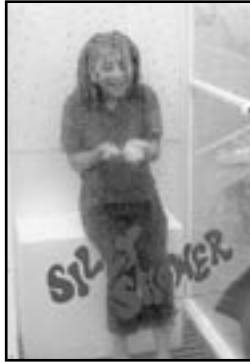
Soak a friend at the Silly Shower.

away wetter than when you came. R o u n d - i n g out the day's excitement are over twenty scheduled s h o w s , demonstrations and educational experiences on four stages.